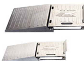
RoadRunner™ Platform Wheel Weigher

Three- or Four-Platform Wheel Weigher System for a variety of light to medium applications, designed for easy transportation. Cast aluminum platforms feature non-slip surface, interlocking ramps, and wheel chocks.