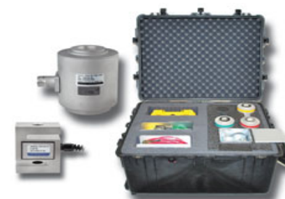
RoadRunner™ Jack Point

The Evergreen Weigh Road Runner Jack Point Weighing System fits on top of existing aircraft jacks. The easy to use system is ideal for weighing aircraft or helicopters to verify CG or after retrofitting New equipment.