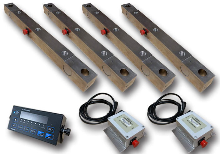
Long Logger System - 9100595